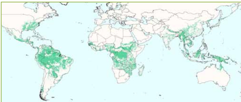
Potential distribution of bamboo within existing forest cover.