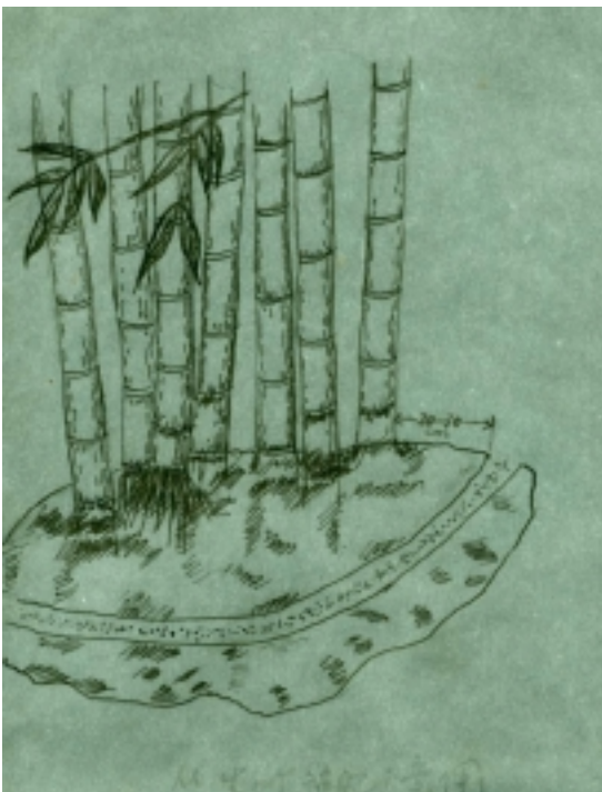
Figure 2: Fertilizing in sympodial bamboo stand

are required: dig a channel about 10-15cm deep and at 20-30cm distance from the clump, distribute the fertiliser in the channel and then cover it with soil. Amounts required: 750-1,500kg/ha of rapeseed cake fertilizer, (or 1-2kg per clump), 30,000-45,000kg/ha of other organic fertilizers (or 35-50kg per clump), and 350-450kg/ha of chemical fertilizers (urea) (or 0.5-1kg per clump). In monopodial bamboo stands, organic fertilizer can be applied with deep scarification. At first, about 30,000-45,000kg organic fertilizers are distributed per ha and then covered with soil when the soil is scarified. Chemical fertilizers should be applied in channels, which are dug in parallel approximately 2-3m apart and 10cm deep (see Figure 1 and Figure 2). The amount of chemical fertilizer ranges from 300 to 450kg per ha. On the other hand, chemical fertilizers can also be applied in channels dug next to each culm. These channels are about 50cm from the culm and are 10cm deep. Two hundred grammes of fertiliser is applied per culm.