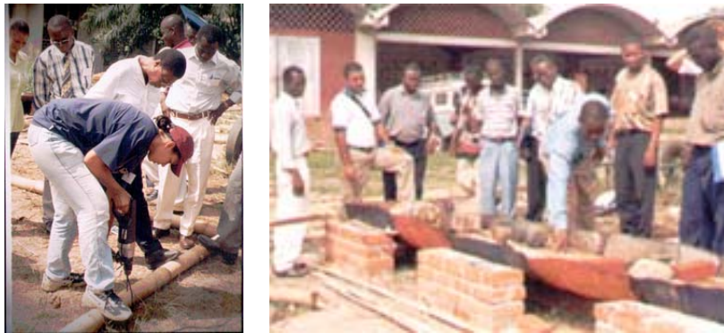
Participants practising preservation techniques

A practical demonstration of bamboo preservation was held at BRRRI. The participants saw at first hand how the work was carried out, and were able to try the various processes for themselves. This approach ensured that the participants had a good understanding of the principles involved, and also that their questions could be answered with reference to a real working environment.