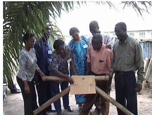
Practical session on bamboo jointing