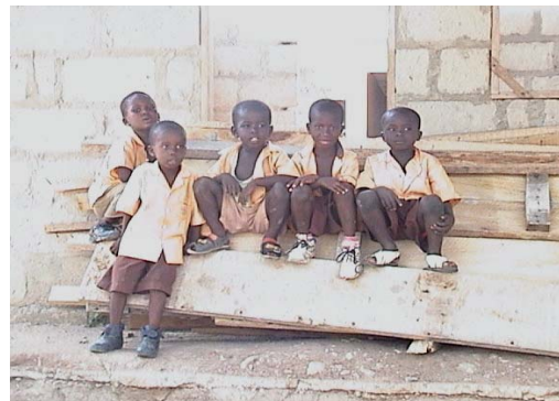
School children – hope for the future

In rural areas, shortages extend to basic public infrastructure. Only 76% of children obtain primary school education, decreasing to 37% at secondary school level. Many children in rural villages are deprived of primary education simply due to lack of school facilities in the village or immediate neighbourhood. Such circumstances demand cost-effective, quick and sustainable solutions. Bamboo construction offers significant potential, with simple technology able to provide permanent solutions to building shortages nationwide.